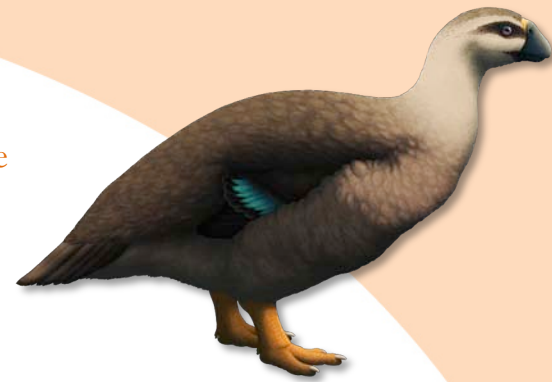
Nix Draws Stuff (alphynix)